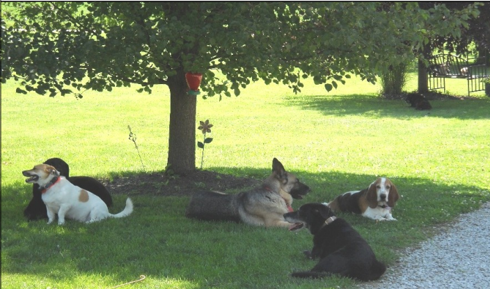
Dalmatian puppies are pure white when they are born and develop their spots as they grow older. The same is true for Australian Cattle Dogs that are part Dalmatian.

Their home is on 8 acres in the country with several of those acres fenced for the animals. They currently have 6 dogs - 4 adopted from HSforBC, and 6 cats - 3 adopted from HSforBC.