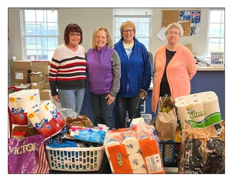
Thank you to the ladies of Auxiliary #2062 of the Lebanon Eagles. These donations will help support our kitties and puppies.