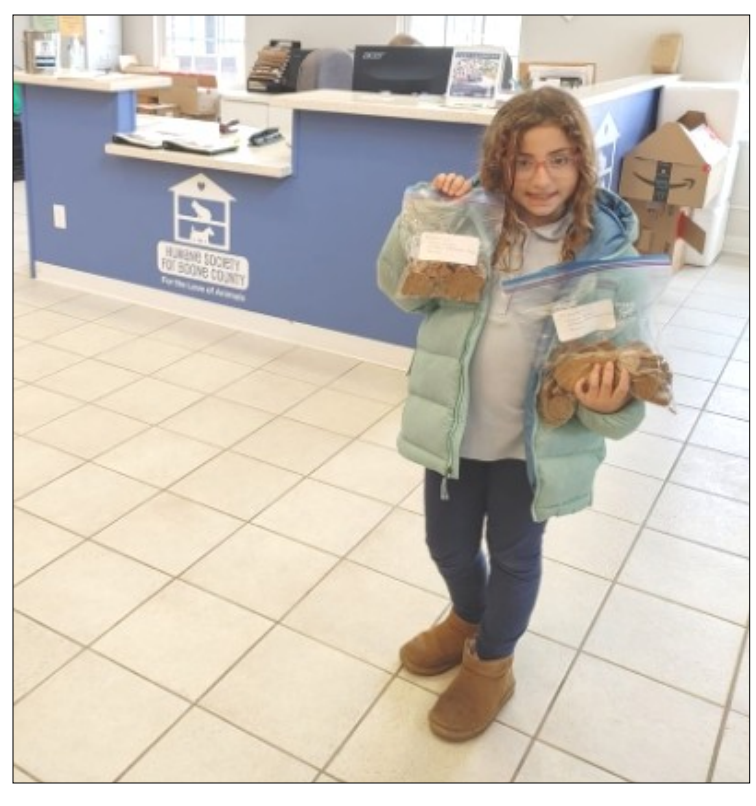
Thank you to Girl Scout Troop #3757 for the homemade treats for our doggies. They love them.