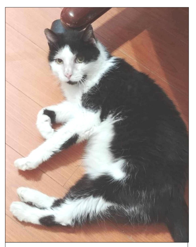
Nori's health improved with loving foster care and medication. She had a black heart in the fur under her chin.

Nori survived a surgery to remove several cysts, but in January her health started failing. She slept more then stopped eating as she neared the end of her life.