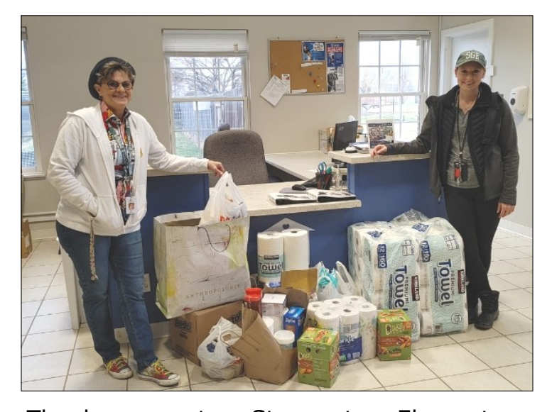
Thank you to Stonegate Elementary Preschool and Kindergarten students. Two classes collected all these donations for Zionsville "Do Days."