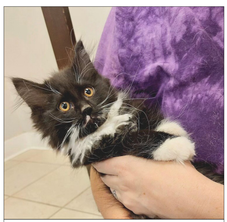
A Cat Program volunteer cuddles with cutie pie Pip during a visit to the shelter clinic for vaccinations.

The week of September 11 was HSforBC's annual "Mums for Mutts" fundraiser with pickup of beautiful potted fall flowers at the shelter.