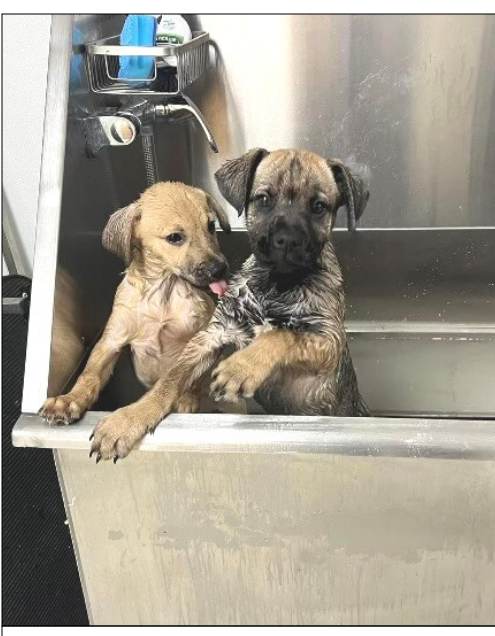
It doesn't get any cuter than bath time for wiggly puppies at the shelter.