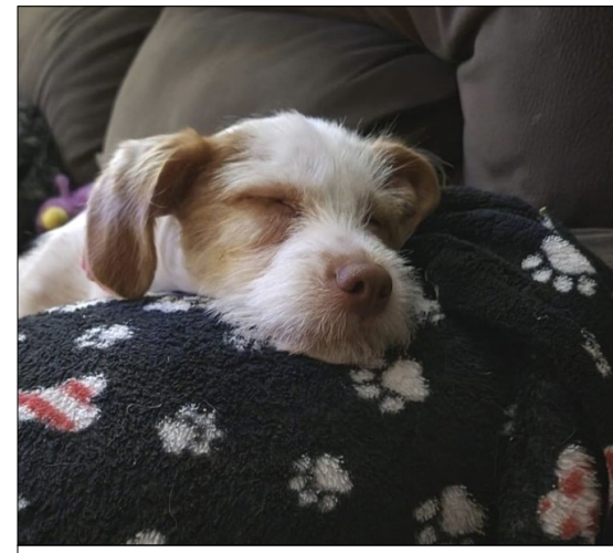
Roxy naps in the safety of her loving foster home.