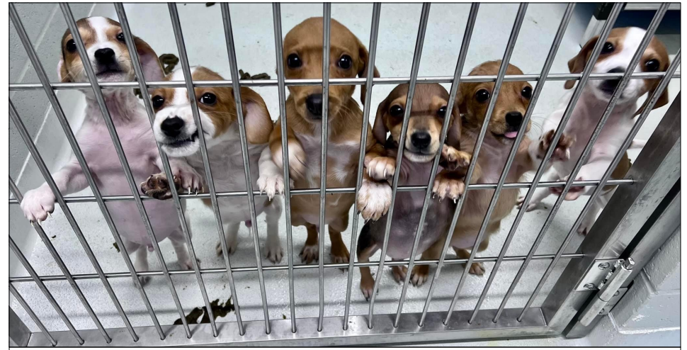
HSforBC is grateful for Dog program volunteers who foster dogs and puppies.

HSforBC staff members, board of directors and our wonderful volunteers wish you a very Happy New Year and we thank you in advance for your continued support during 2024. Year-end donations can still be sent via mail or using the donate button on our website and will be much appreciated! Here's to a great 2024 as our partners for the Love of Animals!