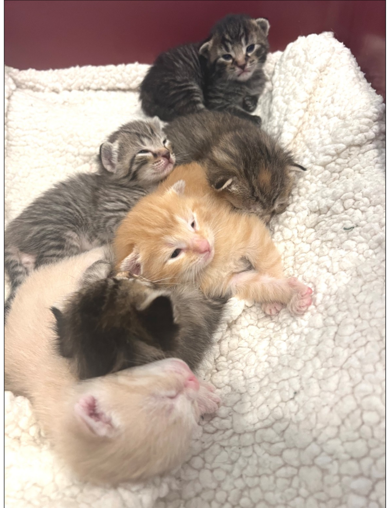
Alli's kittens were born in the comfort and safety of an HSforBC cat foster home.

need to be bottle fed every two hours and receive other life-saving care in the safety of a foster home. Older kittens will also need kitten food and special care in a foster home.