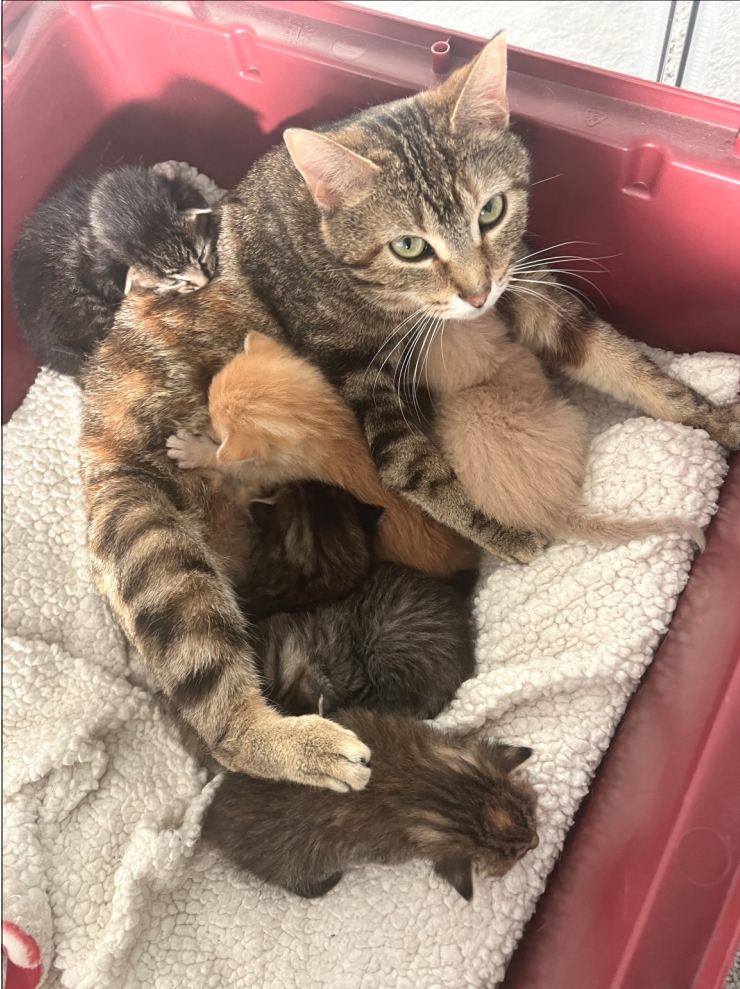
HSforBC foster cat Alli nurses her six newborn kittens.