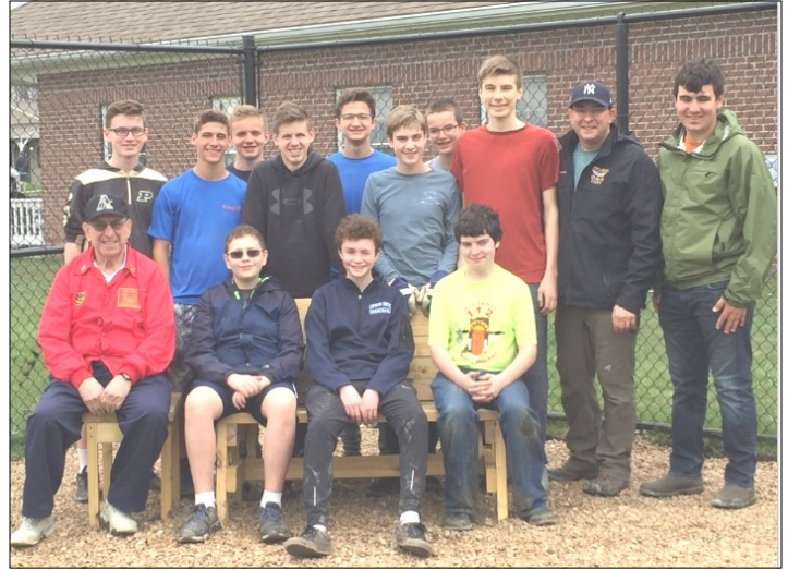
Thank you to the awesome boy scouts for the beautiful bench and table. Good Job!! They look beautiful.