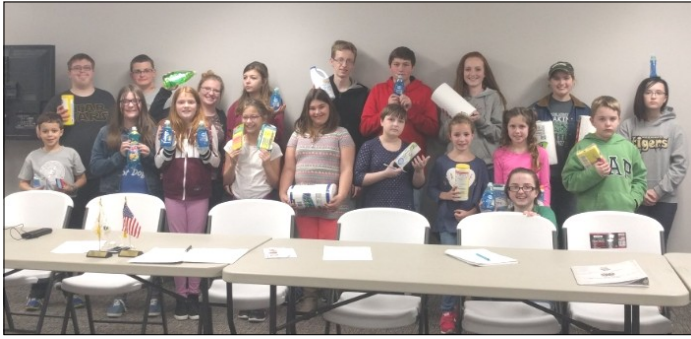
Thank you to the 4H Worthwhile Kids Club for the thoughtful donations