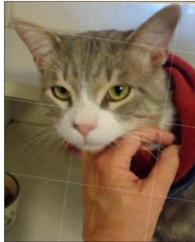
TrailKitty (aka TK)

Beau is 5 months old. He is good with dogs, cats, and kids.