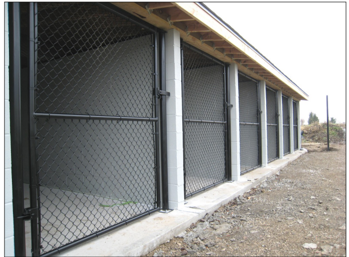
View of kennels from outside