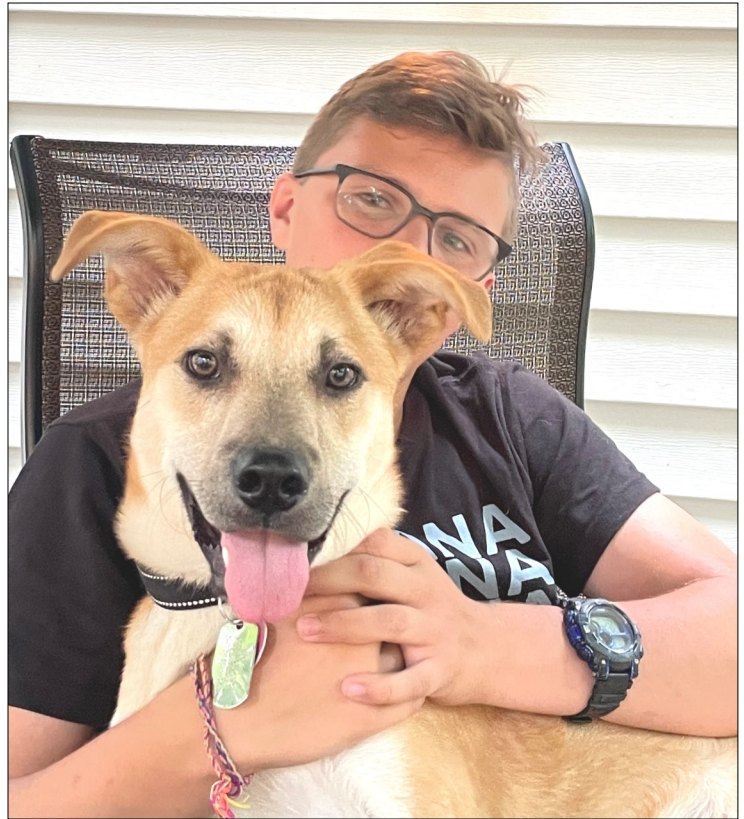
Gabbana, now named Biscuit, poses for a picture with one of his new family members. In a thank you note to HSforBC, the family said, "Biscuit is loving his new environment and forever home."