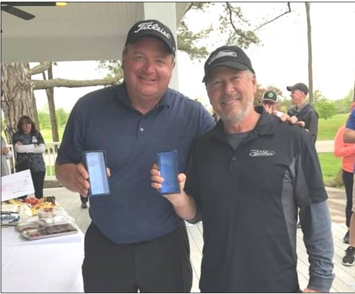
Indy Pro Graphix HSforBC 2021 Golf Scramble winners

The winners of the HSforBC Golf Scramble at Golf Club of Indiana are Indy Pro Graphix. It started as a wet day on May 18. By the end of the second hole, the rain and drizzle had stopped and it was a great day for the players. The golfers and sponsors raised $26,100 for the kitties and puppies at HSforBC. Thank you all for your participation.