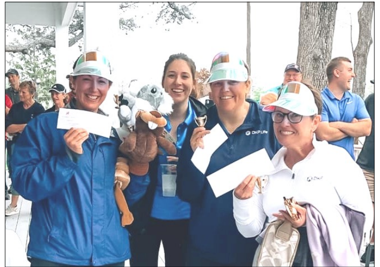
DK Pierce All-Ladies Team never fails to inspire others.