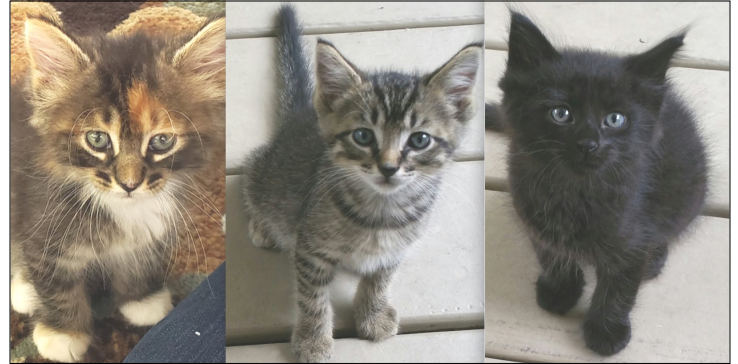
We have kittens

She is lovable, cuddly and about 3 yrs old. All of her teeth were pulled due to resorptive syndrome, where her body was 'attacking' her teeth as foreign objects. Kristi is sensitive and will need a little time to adjust. But she is good with other cats and calm dogs.