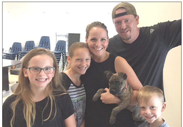
Elijah, now named Raja, with his new family

See page 9 for more information on canine parvovirus.