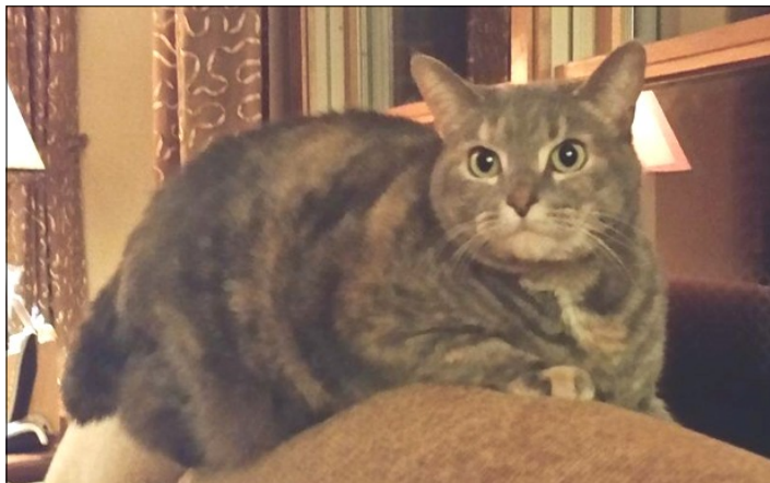
Little Girl, a full bred Manx, is available for adoption.

Congratulations on your new relationship. It's bound to be filled with fun and affection. By starting off on the right foot, you can cut short the adjustment period.